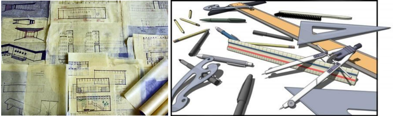
Use of multiple sketches on trace during preliminary design.

The difficult technical challenge is how to convert a sketch into a model, one that can ultimately be used for analysis and parametric studies, but in an environment similar to pencil and paper.