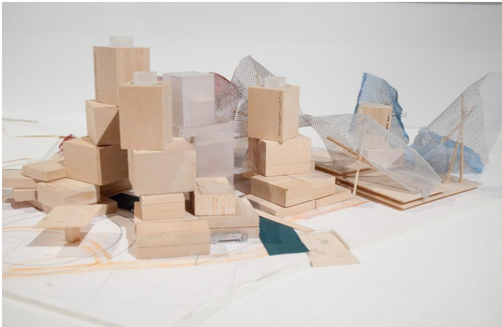
Crude physical models frequently are used at early design stage. Shown here: Frank Gehry's working model for Abu Dhabi's Guggenheim Museum in 2007.