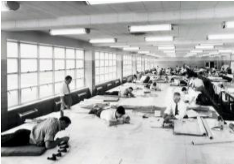
Historical labor intensive drafting using splines to creates smoothly varying curves.